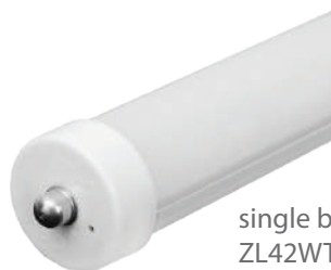
single bi-pin ZL42WT850KUL