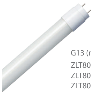
G13 (medium bi-pin) ZLT8041540 ZLT8041550 ZLT8041565